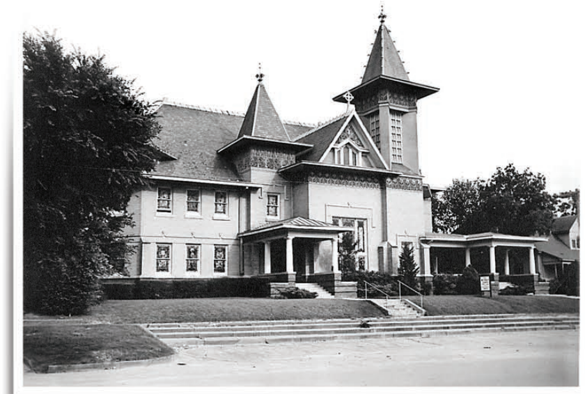
FUMC church building on College St., 1905 – 1940